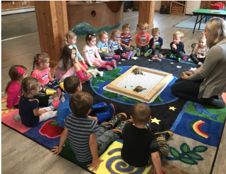
Circle time inside (feeding our classroom tortoises)

Each Young Naturalist class is just under three hours, and in that time the children are provided with many opportunities to interact with each other and with their environment. They explore and make discoveries as they are introduced to a variety of science and nature topics through self-directed as well as teacher-directed activities. To give you an idea of what might be happening any given day, here are some of the things that your Young Naturalist might participate in: