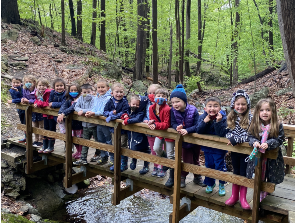
Hudson Highlands Nature Museum