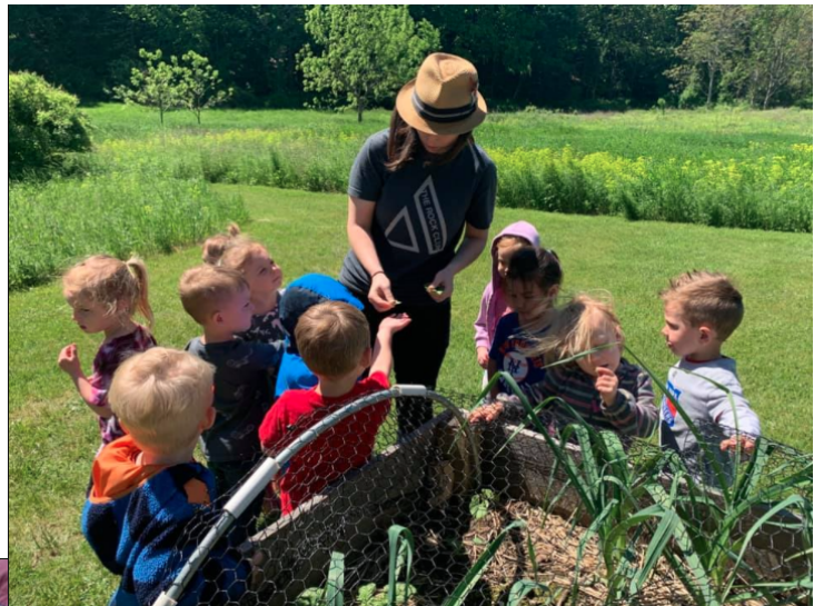
A science lesson outside (eating spinach that we planted)